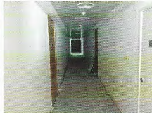
Common Corridor – 2 nd Level