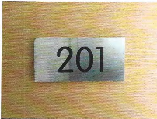
Unit No. 201 (Show Apartment)