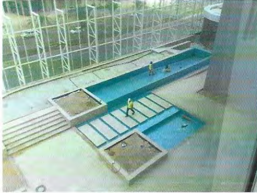
View – Pool

Plot No. 72, 30 (Serviced Residential Apartments) in The Pad Tower, Business Bay, Dubai, United Arab Emirates.