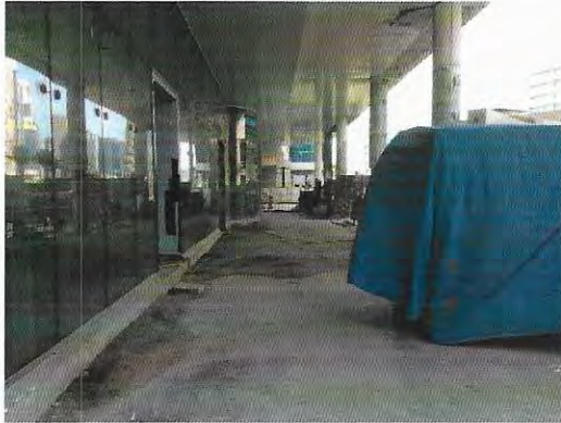
The Pad – front entrance area