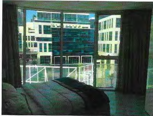
Bedroom - Unit No. 201 (Show apartment)