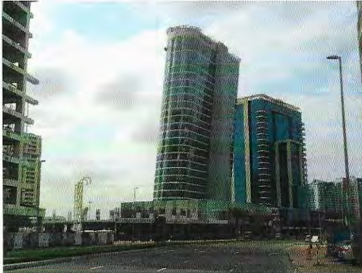
Subject Tower (The Pad)