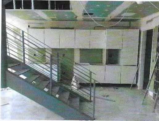
Integrated living/dining / staircase – loft unit