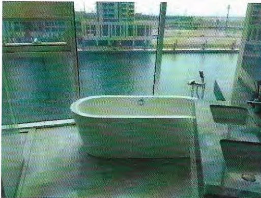
Bathroom - Unit No. 201 (Show apartment)