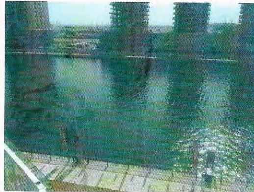
View – Canal