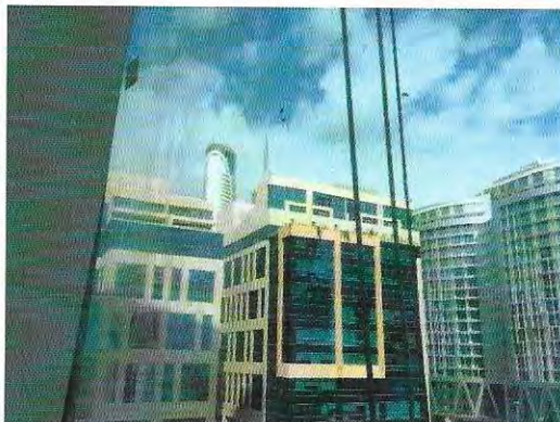
View - V. partial Burj Khalifa / Community