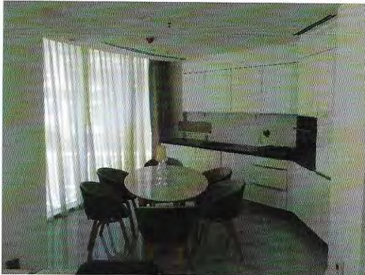
Kitchen – Unit No. 201 (Show apartment)