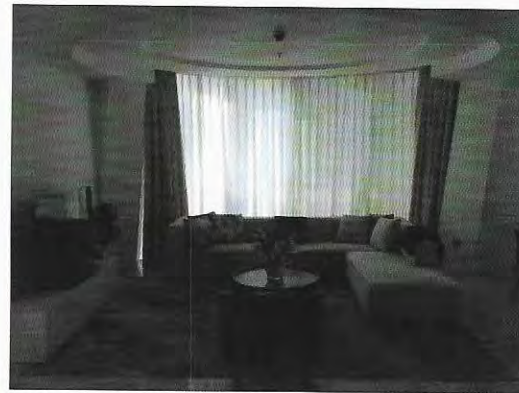
Integrated living/dining area – Unit No. 201 (Show apartment)