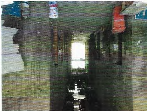
The Pad Tower – Main lobby