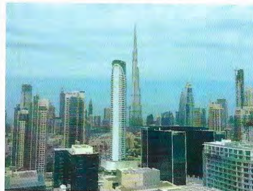
View – from high floor – Burj Khalifa