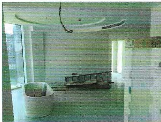
Integrated living/dining area