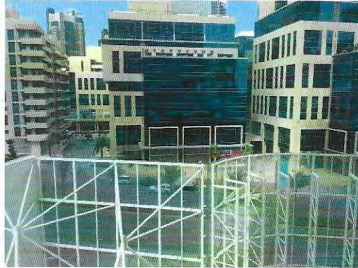
View – Community