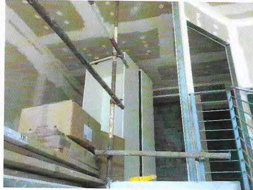
Loft – upper level