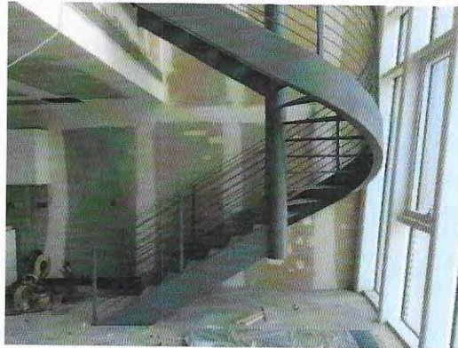
Integrated living/dining / staircase – loft unit