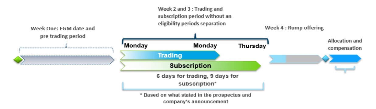
Figure no. (2): The mechanism for trading and underwriting traded rights.

The following figure shows the mechanism for trading and underwriting traded rights: