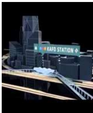
KING ABDULLAH FINANCIAL DISTRICT STATION

The Riyadh metro will span over 178km including underground, elevated and at-grade sections. The three major metro stations (intersection of the lines) KAFD, Olaya and downtown will be designed by world renowned architectural firms to include Gerber Architekten, Snohetta and Zaha Hadid.