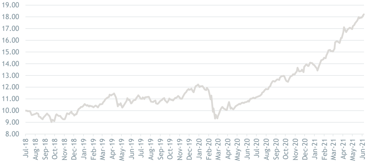
Fund performance since inception