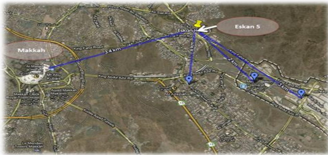
Map (2): Location of Eskan Tower 5

The Fund Manager acknowledges that there is a direct or indirect conflict of interest between the following parties with respect to Eskan Tower 5