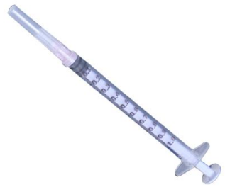
Q Ject® 1 ml Syringe