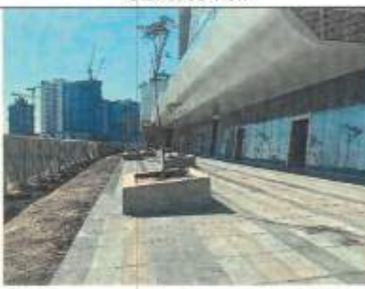
View of Walkway-waterfront area