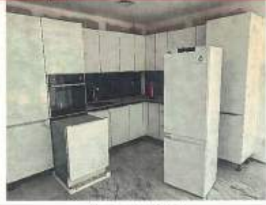
Kitchen Loft Unit