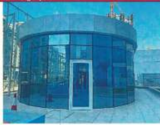
Health Club- Gym