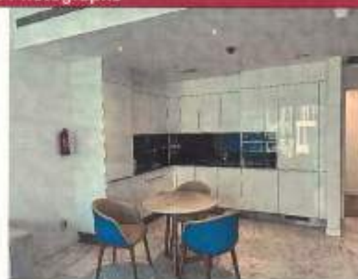
View of Typical Kitchen