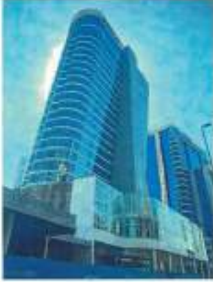
View of THE PAD by Omniyat