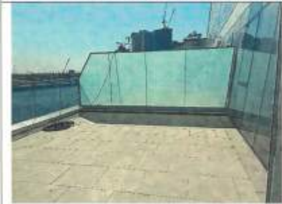
Mezzanine unit with Balcony