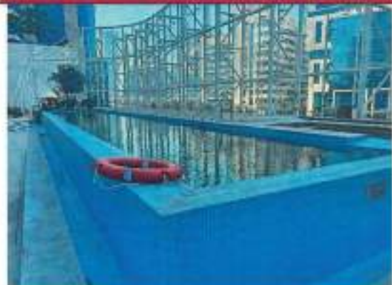
Health Club- Swimming pool