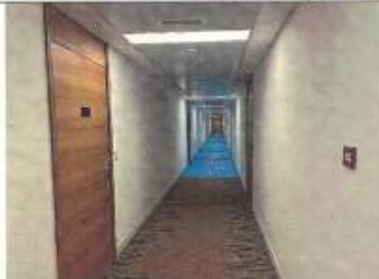
View of Typical corridor