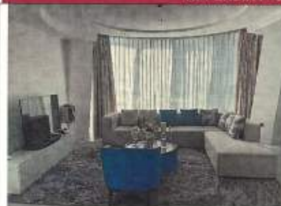
View of Typical Living Room