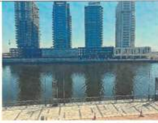
Unit with canal / waterfront view