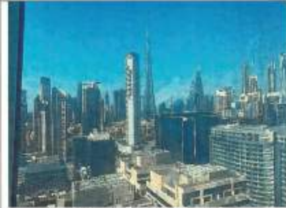
Unit with Burj Khalifa view