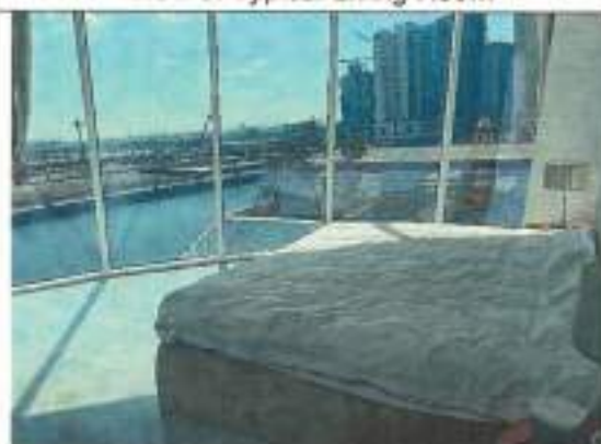
View of Bedroom