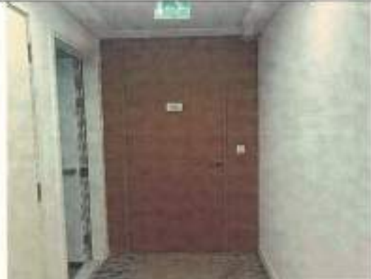
Typical View of Apartments- Unit 201 (sample unit)