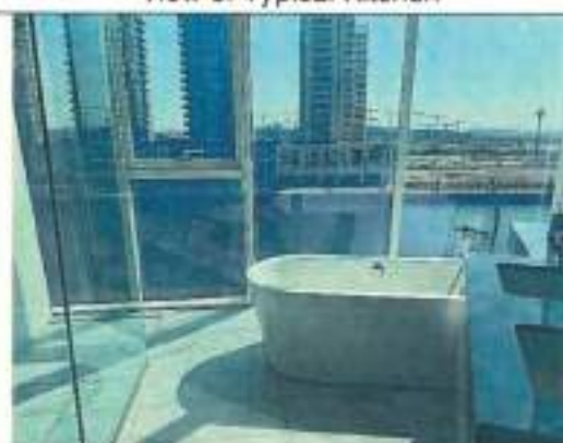
View of T&B