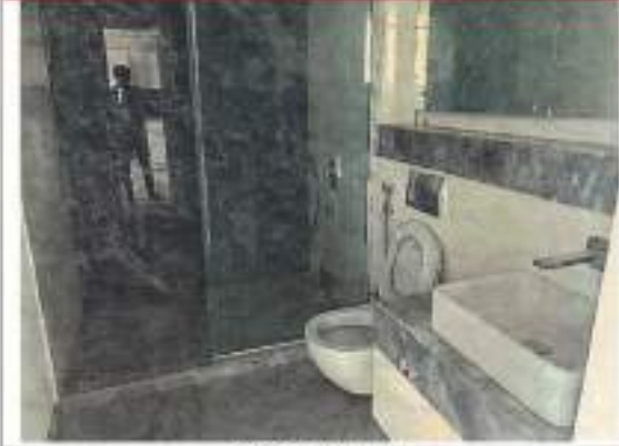
T&B Loft Unit