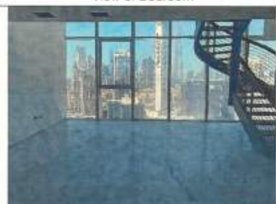
Living Room Loft Unit