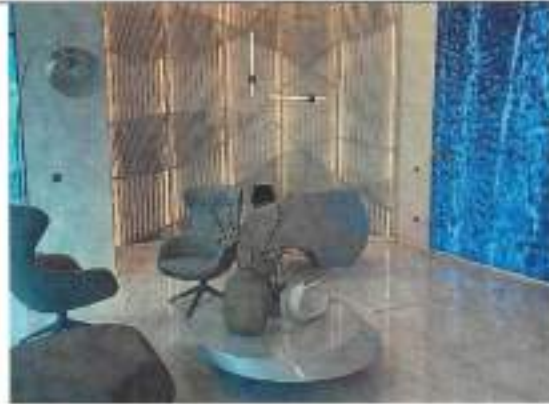
View of Ground Lobby & Lounge