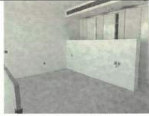
Bedroom -Loft unit