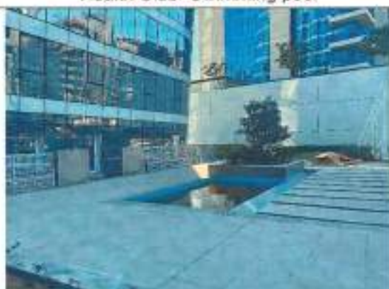
Health Club -Mini Playground and Pool deck