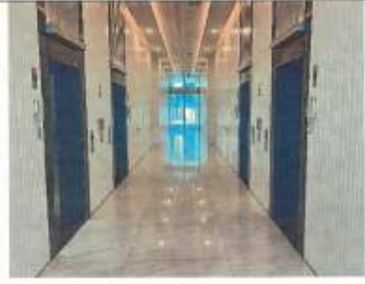
View of Ground Elevator Lobby