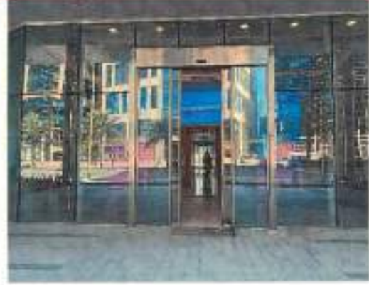
View of Main Entrance