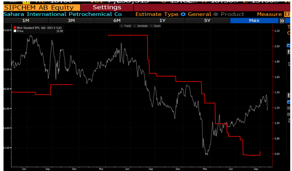
Figure 2 Bloomberg consensus earnings 2021 vs. Sipchem stock price

Valuation and Risks: While there are near term headwinds in the elevated costs levels and global economic contractions, the medium-term outlook looks positive, given its healthy fundamentals, production & operating efficiencies, and likely cost-synergies (SAR175-225mn impact in recurrent EBITDA post its merger with Sahara), along with healthy FCF generation capabilities and comfortable debt position.