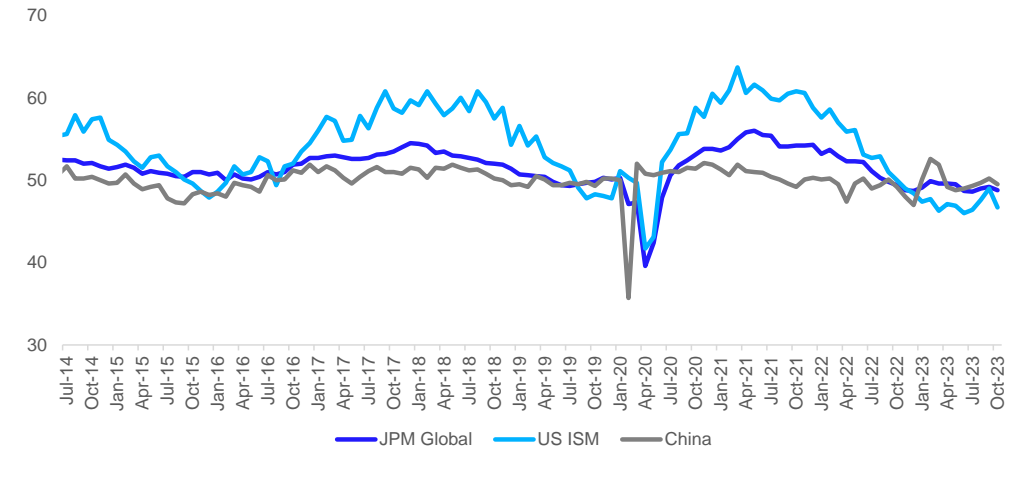
Figure 3 Manufacturing PMI