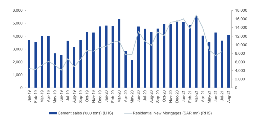
Figure 2 Trend in cement volume and new mortgages

Source: Company data a nd Al Rajhi Capital