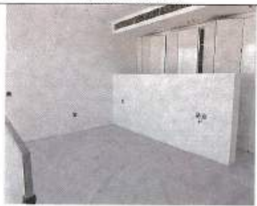
Bedroom -Loft unit