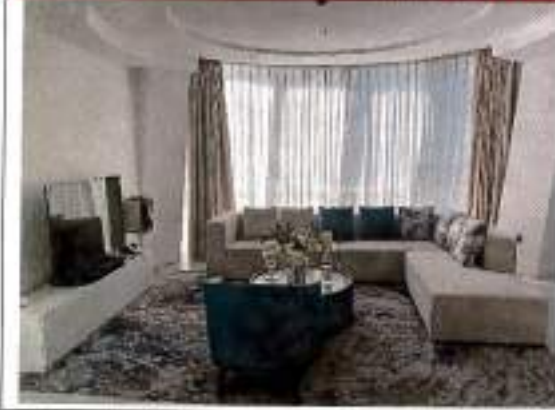
View of Typical Living Room