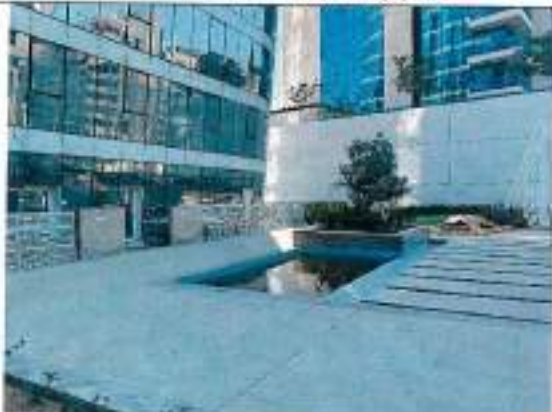
Health Club -Mini Playground and Pool deck