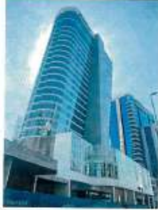
View of THE PAD by Omniyat