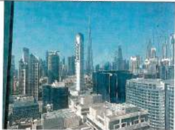
Unit with Burj Khalifa view