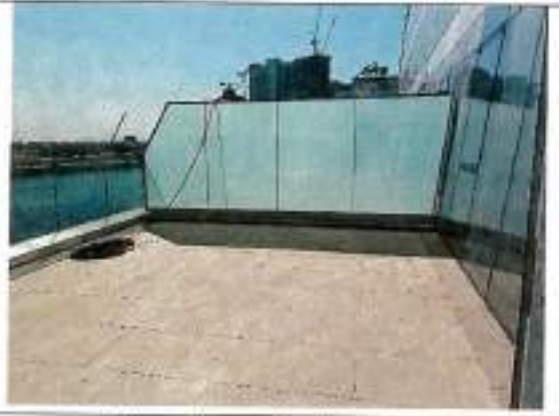
Mezzanine unit with Balcony