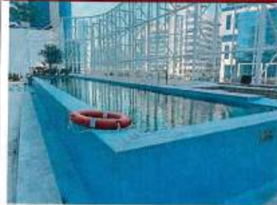
Health Club- Swimming pool