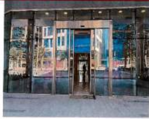
View of Main Entrance