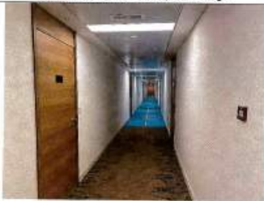
View of Typical corridor