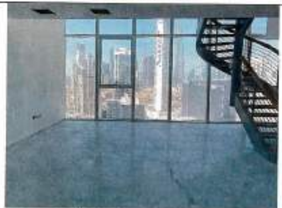
Living Room Loft Unit