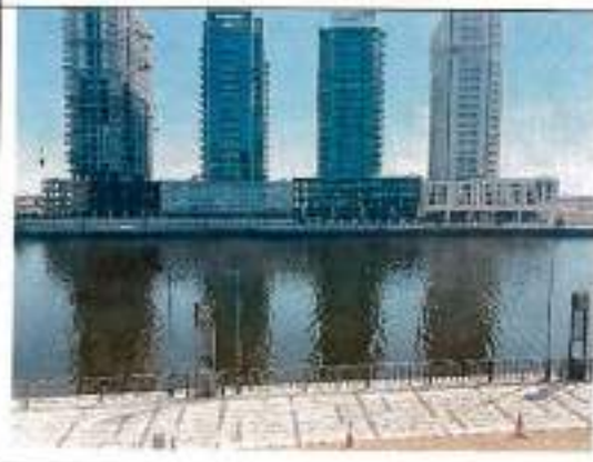
Unit with canal / waterfront view