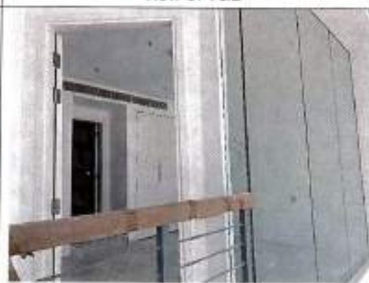
Bedroom Loft unit