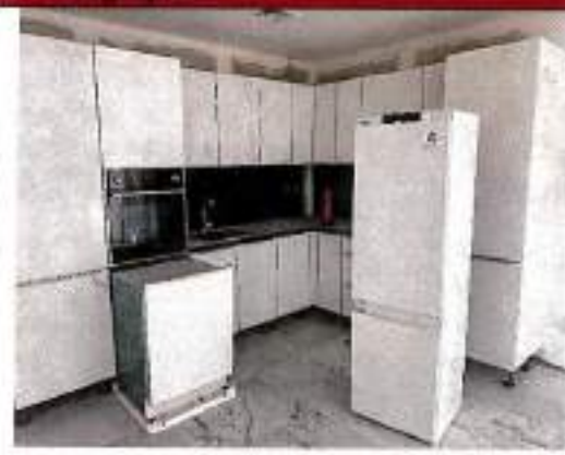
Kitchen Loft Unit