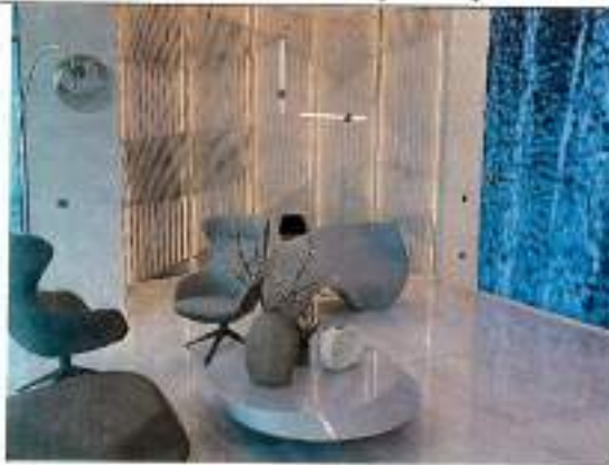
View of Ground Lobby & Lounge