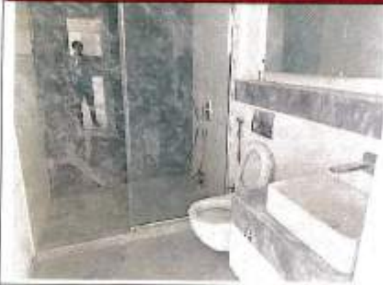
T&B Loft Unit