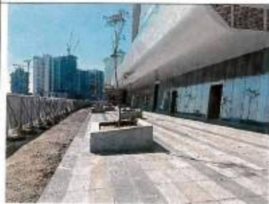
View of Walkway-waterfront area