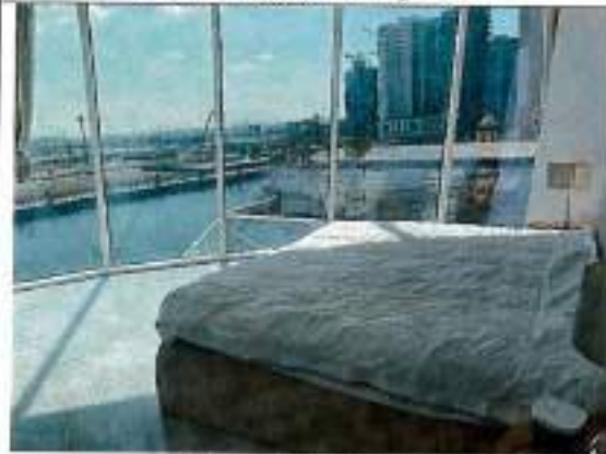
View of Bedroom