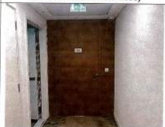
Typical View of Apartments- Unit 201 (sample unit)