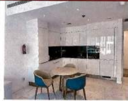
View of Typical Kitchen