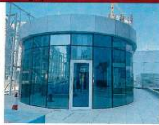
Health Club- Gym