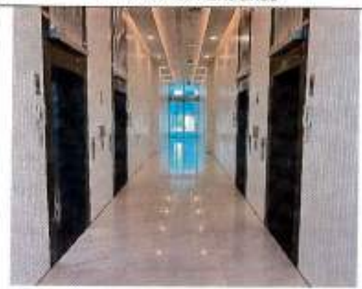
View of Ground Elevator Lobby