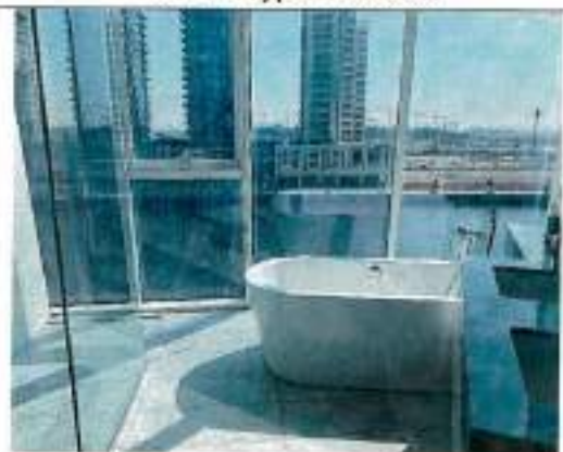
View of T&B